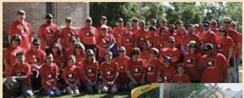
Extreme Community Makeover