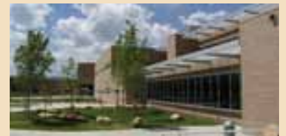
Academy School District 20, Discovery Canyon Campus

Since 1974, GH Phipps has partnered with the Academy School District 20 in Colorado Springs on 13 different projects. Discovery Canyon pre-K through 12, located on a 75-acre site north of Colorado Springs, was built to support a curriculum using the principles and tools of math and science.