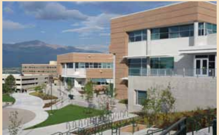
University of Colorado Colorado Springs, Osborne Center for Engineering and Science

This campus that stretches along scenic Austin Bluffs Parkway has been transformed by GH Phipps, through construction and remodeling projects that gave Cragmor Hall a new life, provided students the expansive housing of Summit Village, and addressed technology through the Osborne Center for Engineering and Science.