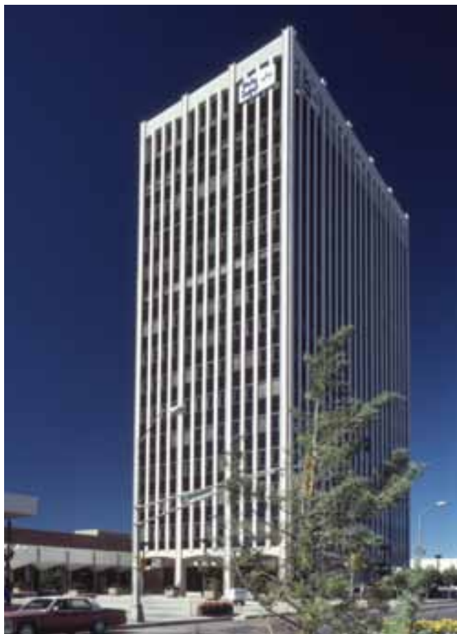
Holly Sugar Building Colorado Springs, Colorado