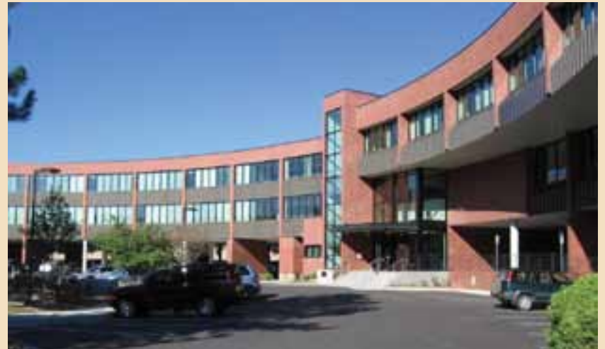
University Corporation for Atmospheric Research (UCAR) Anthes Building