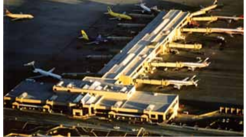
Colorado Springs Airport Terminal Colorado Springs, Colorado