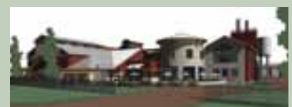
Odell Brewing Company RB+B Architects, Inc.

In July, GH Phipps was awarded the design-build project to expand the Odell Brewing Company in Fort Collins. The 14,000-square-foot development adds a fermentation cellar and expands the grain handling area, brew house and tap room. RB+B Architects, Inc., of Fort Collins is the architect on this $3 million project, which is expected to be completed in July 2013.