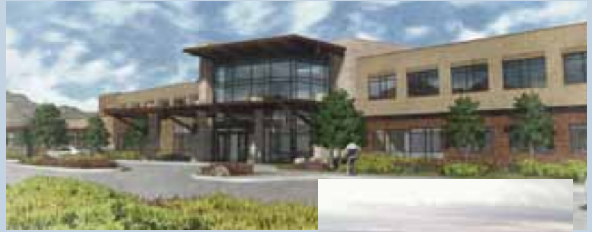
Canyon View Medical Plaza

community through a design by H+L Architecture. GH Phipps constructed a new sign for DU, just in time for camera exposure during preparation for the nationally televised presidential debate held October 3 at DU.