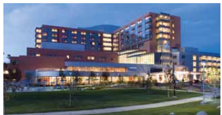
Children’s Hospital Colorado Aurora, Colorado

Change is a constant, and the buildings constructed by the people of GH Phipps will continue to grow and adapt with the times. As we look forward to the next 60 years, we’re watching the skyline continue to change – because of Phipps.