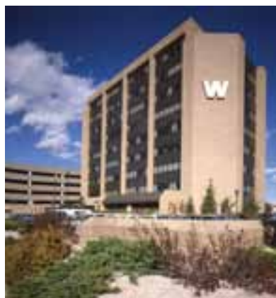
Western Federal Savings Denver, Colorado

Broadway Southwest Store: GH Phipps constructed Broadway Southwest stores in Cinderella City, Villa Italia, and Westminster Mall. Almost 30 years later, all three malls are history, joining the list of un-malled mixed-used developments designed to create new "downtowns" in suburban communities. The Cinderella City store, though, wasn't demolished: It is now the Civic Center in CityCenter Englewood, which houses city offices, a library, courts, and a cultural center. The CityCenter project, planned by David Owen Tryba Architects, includes residential, retail, restaurants, a light rail station, and that busy municipal component.