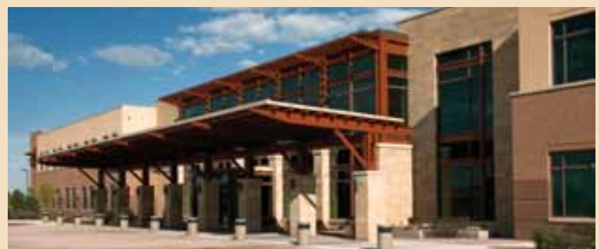
Lincoln Medical Center