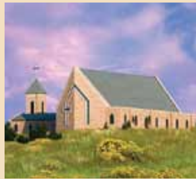
Cherry Hills Community Church

GH Phipps' involvement with this community-oriented church began with work in the original sanctuary, leading to construction of the nearby gem-like chapel in 2006 and work on the Memorial Garden within the complex.