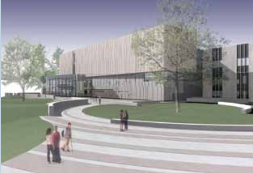
Denver Museum of Nature & Science Education and Collections Facility