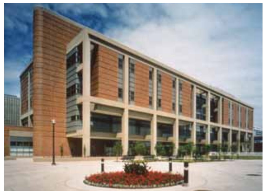
University of Colorado Hospital Critical Care Tower Denver, Colorado

CU needed a new athletic center, and needed it fast. The privately funded Dal Ward center, named after a famed CU football coach, was constructed in less than nine months. Designed by Sink Combs Dethlefs in the stone and brick Tuscan vernacular style for which CU Boulder is known, the phased fast-track project