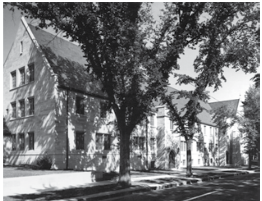
St. John's Cathedral Denver, Colorado