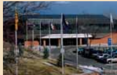
Century Link Teller Facility

We've been connected to "the phone company" since 1952, from Mountain Bell to U.S. West, to Qwest to the current CenturyLink brand. With projects statewide – large (the Zuni Street plant) and small (upgrades to facilities across Colorado) – we continue to service this long-term client.