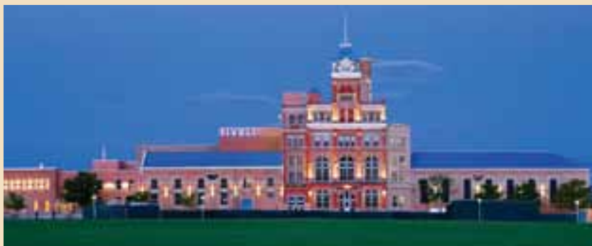
Auraria Higher Education Center, Tivoli Student Union