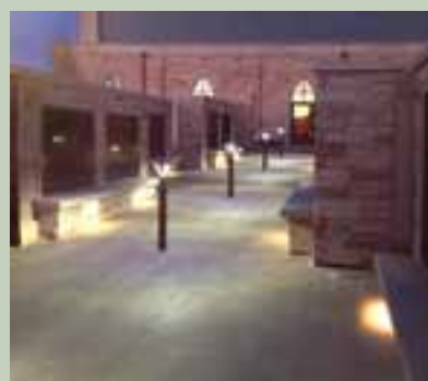
Cherry Hills Community Church Memorial Garden

The Memorial Garden at Cherry Hills Community Church in Highlands Ranch opened November 27 adjacent to the Chapel at Cherry Hills Community Church. The Memorial Garden design by Fentress Architects includes a central pavilion intended for memorial services and other events. The pavilion contains a communal urn for the cremated remains of congregants and those from the surrounding community, as well as a place for wall-mounted plaques to honor those who have passed. On either side of the pavilion, two lighted arcades hold a series of niches designed for actual urns. The $1.2 million project helps fulfill the church's mission of ministering to members through all phases of their lives. The pavilion and arcades are constructed of the same cut of sandstone used in the chapel, creating a contemplative mini-complex on the overall church campus. GH Phipps also constructed the 400-seat chapel, another design by Fentress Architects; it opened in 2006.