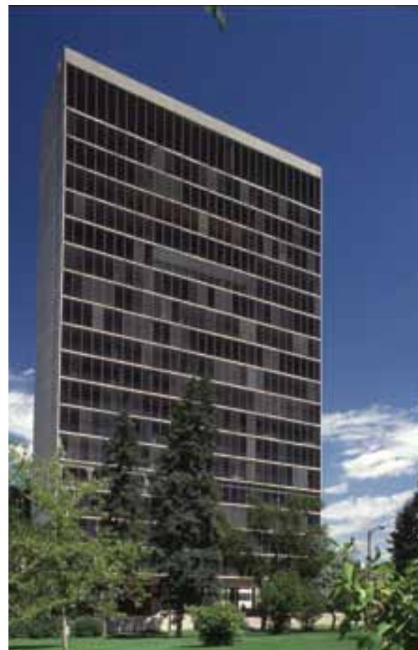
One Cheesman Place Denver, Colorado

Celebrity Sports Center, 888 S. Colorado Blvd., Glendale: The long arm of Walt Disney reached into Denver for a bit, with the opening of the Celebrity Sports Center. The center’s numerous activities and flamboyant atomic-age sign drew people from all over, becoming a pleasant memory of high school trips for anyone who lived in the metro area.