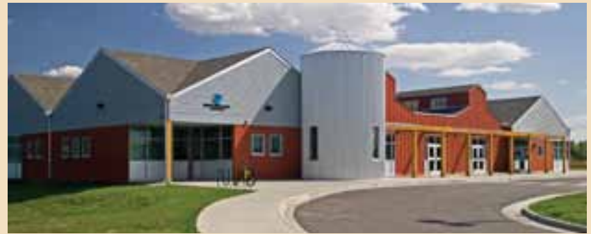
Boys and Girls Clubs, Shopneck Branch