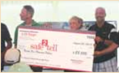
Charity Golf Classic benefitting Safe2Tell

"Everyone on the team is committed to making this event successful and raising funds on an annual basis to make a significant impact to a charity,"