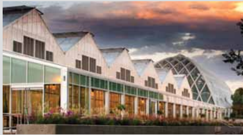
Denver Botanic Gardens Denver, Colorado

Over the years, Gardens officials have tweaked their buildings and refined their programming, but after voters approved the Better Denver Bonds in 2007, the institution had the means to make important changes. Like building a 316-stall parking structure flanked by York and Josephine streets, replacing a small surface parking lot and helping to clear up much of the