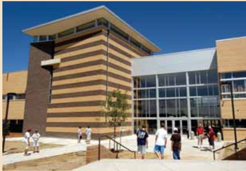
Regis Jesuit High School