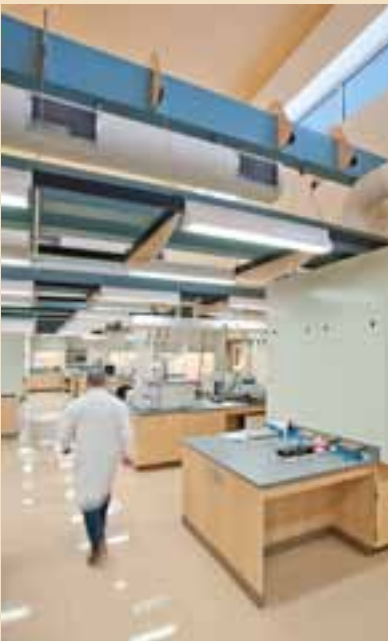
State of Wyoming Joint Labs

GH Phipps’ experience constructing laboratory facilities led to the firm’s selection in 2010 and 2011 to build projects where higher education and high-tech converge: the Cheyenne Combined Lab Facilities, and the Laramie-State Veterinary Laboratory.