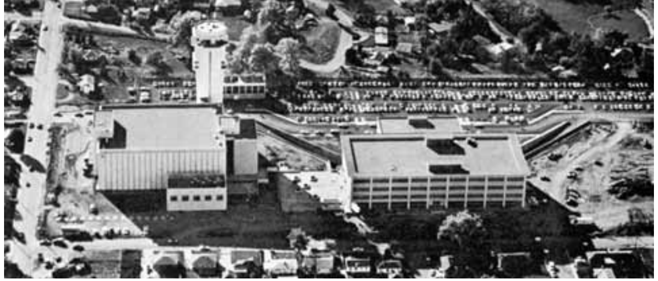
Century Link Zuni Communications Center Denver, Colorado