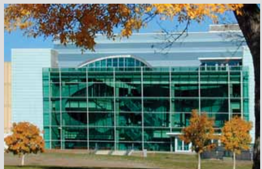
Denver Museum of Nature & Science Denver, Colorado

Our firm currently is constructing a much-needed five-level Education and continued on page 4