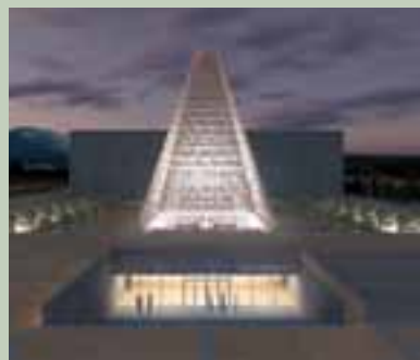
United States Air Force Academy Center for Character and Leadership Development

Groundbreaking was held Oct. 19 for the United States Air Force Academy's Center for Character and Leadership Development (CCLD), a project that embodies the academy's vision for developing leaders of character.