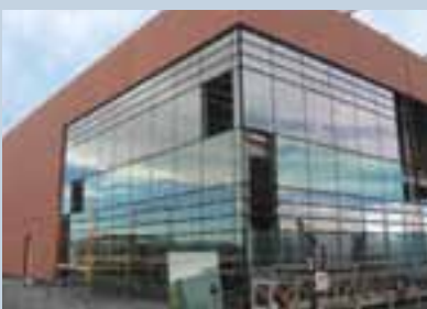
Community College of Denver Student Learning and Engagement Building

This 85,000-square-foot educational building is the Community College of Denver's first dedicated facility on the Auraria campus, providing administrative spaces, student services and classrooms. Work by GH Phipps is continuing on roughing-in and completing building enclosure systems. Sitework and hardscape is following, with ultimate project completion estimated at the end of spring. The four-story, $28 million structure is located on a tight project site at Curtis and Seventh streets, adjacent to the Ninth Street Historic District. Designed by OZ Architects of Denver and Boora Architects of Portland, Oregon, what was formerly called the Student Learning and Engagement Building is being built as a LEED Gold certified project, including energy-efficient techniques and necessary cost-effective measures.