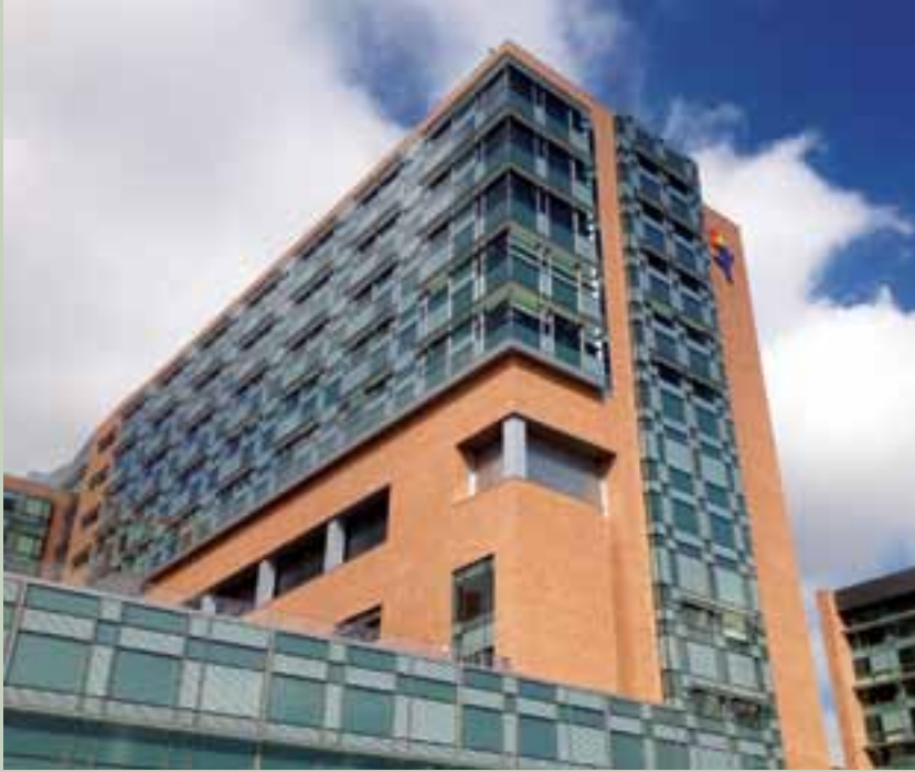
Children's Hospital Colorado East Tower addition and renovations