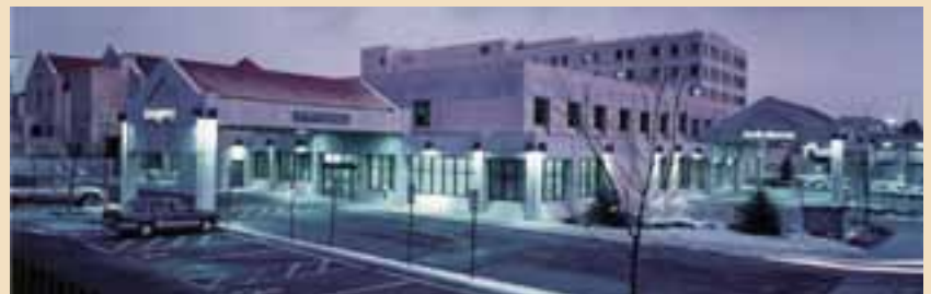
Exempla Lutheran Medical Center