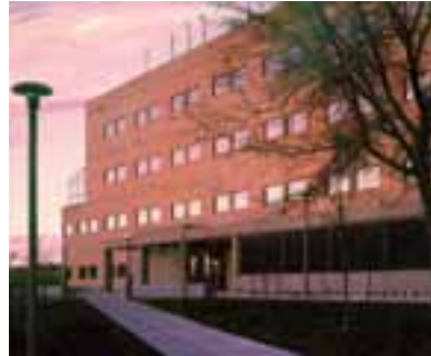
Colorado State University Molecular and Radiological Biosciences Building Fort Collins, Colorado

The trendy Cherry Creek North neighborhood has long included office buildings and financial institutions. Among them is the 300,000-square-foot, honey-colored Western Federal Savings, constructed of precast concrete in 1978 to include nine stories and a six-level parking structure. Even though someone along the way added a parasol-like element on an upper floor terrace, the building still stands as a distinctive tower in what has for years been a low-rise neighborhood.