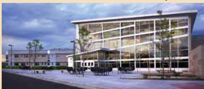
Jefferson County Public Schools, Bear Creek High School

GH Phipps began its K-12 work here with construction of two schools in Arvada in 1954; since then, major new schools and numerous renovations and restorations have forged a link with Jeffco's schools and citizens.