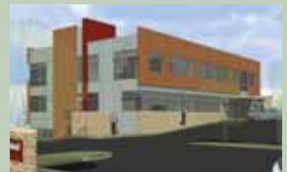
Northwestern Mutual West Denver Office Courtesy of Barker Rinker Seacat Architecture

GH Phipps was awarded this $3.4 million project to construct a new building for Northwestern Mutual's west Denver office. The 18,600-square-foot building designed by Barker Rinker Seacat Architecture includes open and closed offices, conference rooms, a café/bar/kitchen area, locker rooms, and a lobby with a fireplace. The three levels include a lower, garden level. Groundbreaking was October 15, and completion is anticipated for late May 2013.