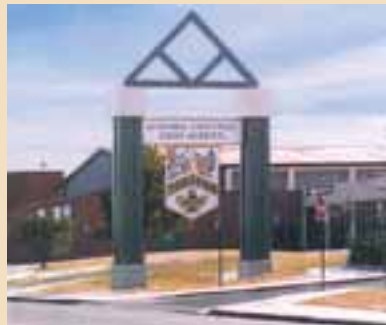
Aurora Central High School

Numerous schools in this city east of Denver have been built and renovated by GH Phipps, starting in 1957 (Central High School and Jamaica Elementary School) and leading up to the 2004 renovation of South Middle School.