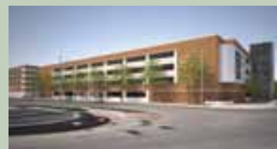
Denver Health Acoma Street Parking Garage

Acoma Street Parking Garage: This 690-stall, five-level parking structure is expected to be completed in October 2013. During construction, access must be maintained to the coroner's office nearby, and demolition was required