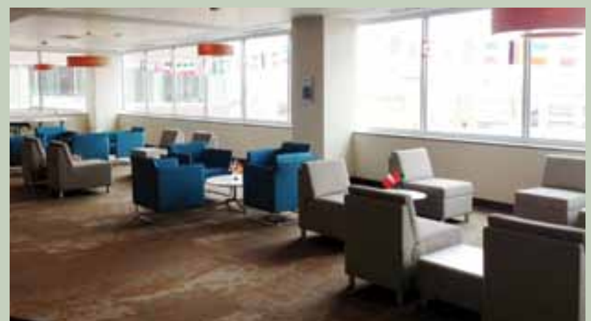
University of Colorado Denver Business School Renovations

The $14.7 million project, completed with RNL Design, involved multiple renovations that remade an existing office and retail tower, adding IT upgrades that support prominent high-tech features such as the JP Morgan Center for Commodities and a stock ticker crawl. The 120,000-square-foot building is LEED Gold certified and can accommodate more than 5,000 students each day, enrolled in undergraduate and graduate programs located at the heart of the metro area's business community.