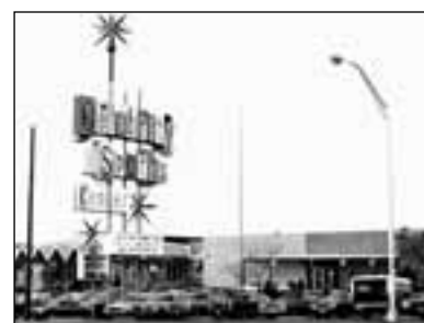
Celebrity Sports Center Denver, Colorado