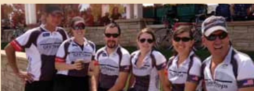
Good Sam Bike Jam