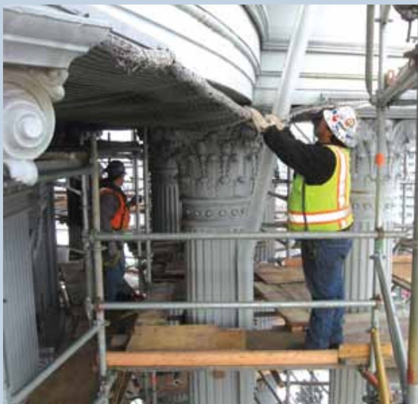
Colorado State Capitol Dome

GH Phipps is working in association with the Christman Co.; and the design team of Martin/Martin Inc., Quinn Evans Architects, in association with Humphries Poli Architects. Estimated completion of the $17 million project is June 2014.