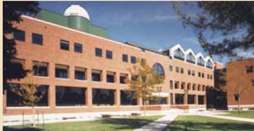
Colorado College, Barnes Science Building