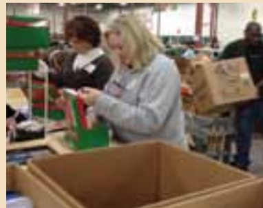
Operation Christmas Child