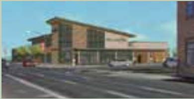
View from the northwest, toward the entry at East 18th Avenue and Downing Street. Courtesy of Metro CareRing / Rendering by Barker Rinker Seacat Architecture