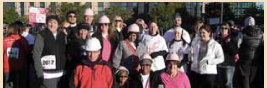
The Komen Race for the Cure