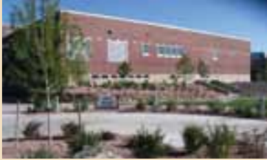
Aims Community College, College Center

This veteran educational institution has established a relationship with GH Phipps on projects on its Greeley campus, the center of a growing network of academic facilities. We’ve since completed several projects with this client.