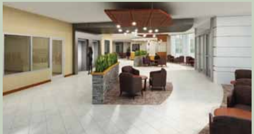
The Center at Lincoln Skilled Nursing Facility

The annual gala celebrating the achievements of Colorado's general contractors and subcontractors was held November 2 in the Hyatt Regency Convention Center Hotel in downtown Denver.