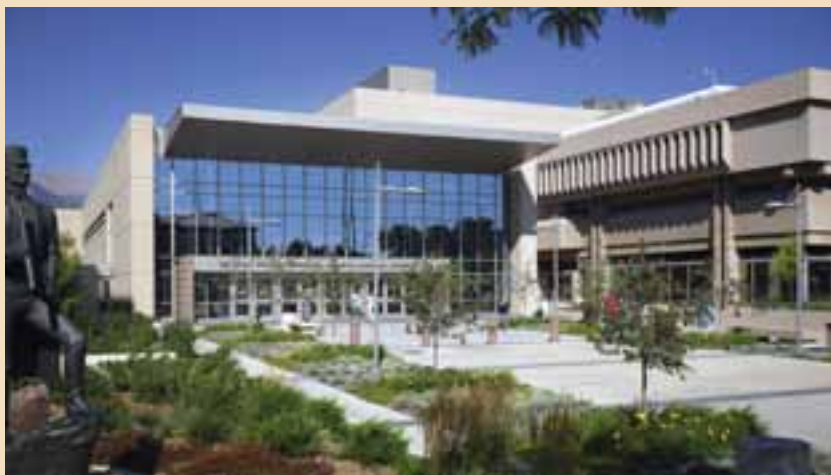
El Paso County Criminal Justice Center

The University Corporation for Atmospheric Research in Boulder is one of the country’s top research facilities; GH Phipps has been involved in several projects there involving renovations, remodels and laboratory refinements.