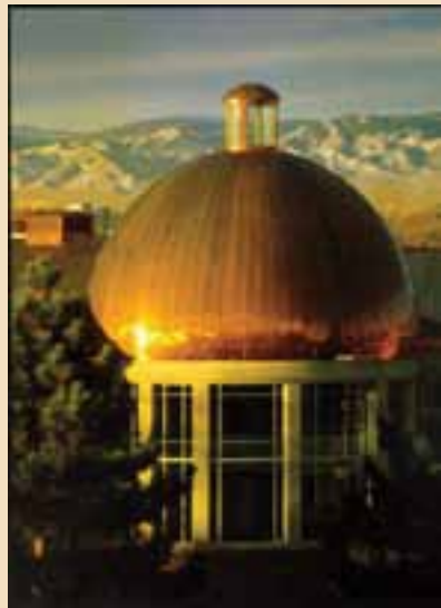
University of Denver Olin Hall

From the reconstruction of the Evans Memorial Chapel in 1959 through numerous buildings and parking structures, GH Phipps has become a regular campus visitor. The current project: remaking the Penrose Library into a full-service place for students to gather, the Academic Commons.