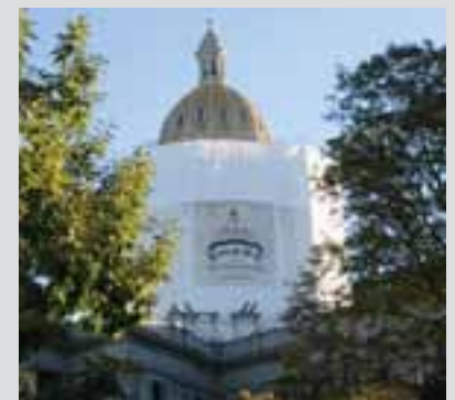
Colorado State Capitol Denver, Colorado

GH Phipps is working on the dome in association with the Christman Co., and the design team of Martin/Martin Inc., Quinn Evans Architects and Humphries Poli Architects. Completion of the project is estimated to occur in June 2014.