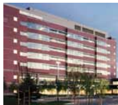
Anschutz Outpatient Pavilion Aurora, Colorado

University of Colorado Hospital, Anschutz Outpatient Pavilion, Anschutz Medical Campus, 1635 Aurora Court, Aurora: This seven-story building, connected to the Anschutz Cancer Pavilion, was the inaugural project on the new megacampus carved out of the former Fitzsimons Army Medical Center in Aurora. Completed in 2001, the outpatient pavilion (AOP) includes 180 exam rooms, 30 procedure rooms, 31 clinics, and six operating rooms, plus a host of support services. The design-build project was a joint venture involving Phipps/McCarthy and the design team of H+L Architecture and HDR Architecture. Since the AOP debuted, construction on the new campus has soared, in zones devoted to education, research and clinical care, and institutions such as the University of Colorado Hospital and Children’s Hospital Colorado.