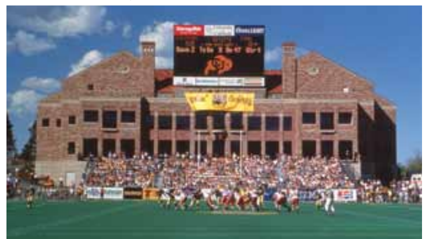
University of Colorado Dal Ward Athletic Center Boulder, Colorado

headed east to a shiny new medical "city" in Aurora. The 1996 Critical Care Tower was constructed as a joint venture project by Phipps/McCarthy. The brick and concrete building, with its notable curved edge facing East Ninth Avenue, was designed by Stone Marracini & Patterson. As for the future, the University of Colorado will maintain dialysis services in the Critical Care Tower until the building is sold, as the university continues to work with potential developers on the property.