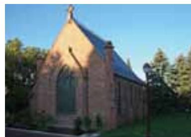
University of Denver Evans Memorial Chapel Denver, Colorado

The University of Denver Evans Memorial Chapel, 2199 Vine St., Denver, moved in 1964: John Evans, the first territorial governor of Colorado, designed and built this graceful chapel in 1878 as a memorial for his daughter. After more than 80 years at its location of West 14th Avenue and Bannock Street, the chapel was moved in pieces to its current location on the DU campus, and reconstructed by GH Phipps. The move was necessary because DU was building its downtown law center on land occupied by the chapel – a location DU vacated years ago. The chapel, on the National Register of Historic Places, remains a favorite site for weddings, and serves