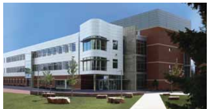
Colorado State University, Diagnostic Medicine Center Fort Collins, Colorado