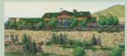
Cabela's Lone Tree Store

GH Phipps also was selected to perform site development and infrastructure work for the 25-acre RidgeGate Commons property at Interstate 25 and RidgeGate Parkway. Cabela's is the anchor store of RidgeGate Commons.